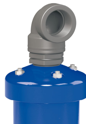
Threaded PP evacuation bend 1" 1/2 supplied as a standard for DN 50/65.