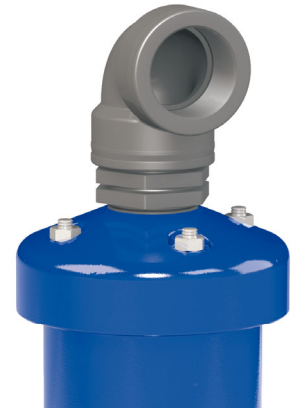
Threaded PP evacuation bend 1" 1/2 supplied as a standard for DN 50/65.